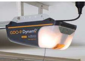
Opener with LED Courtesy Light