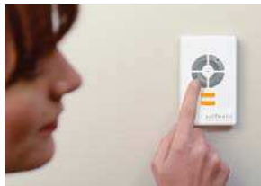
Wall mounted TrioCode™128 control panel