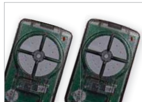
Two TrioCode™128 transmitters